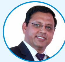
Dr. Rajeev Pachauri